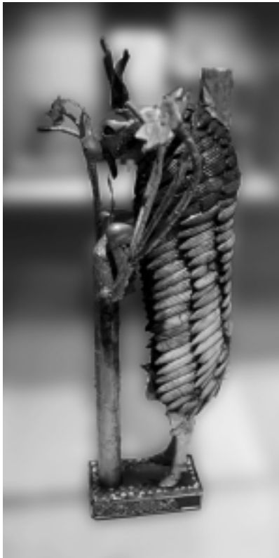
Ram in a thicket. Found in a cemetery at Ur, on the Euphrates River midway between Baghdad and the Persian Gulf, and dating to 2600 B.C.E., this image of a ram eating leaves recalls the story of Abraham finding a ram caught in a thicket by its horns (Genesis 22:13).

The earliest traditions of the origins of the people Israel portray them as a group of clans joined in a loose association based on common ancestry and identification with the religious experience of their ancestor Abraham. The migration to Egypt in a time of threatening famine led to their enslavement by the pharaoh. They discerned direct divine intervention in their successful flight from Egypt and in being led through the wilderness of Sinai to the borders of Canaan, the Promised Land. On arrival they were once more a confederacy of clans, sharing (in addition to their common ancestry) the belief that their God was in their midst, present in the portable shrine (the ark of the covenant) that they brought with them out of the wilderness. The founding principles of their group identity were given to them by revelation through Moses, their leader, at Mount Sinai. To this code they jointly committed themselves.