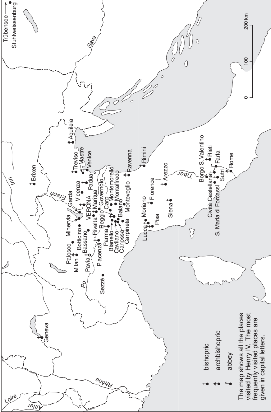
The kingdoms of Germany, Burgundy and Italy in the reign of Henry IV

The map shows all the places visited by Henry IV. The most frequently visited places are given in capital letters.