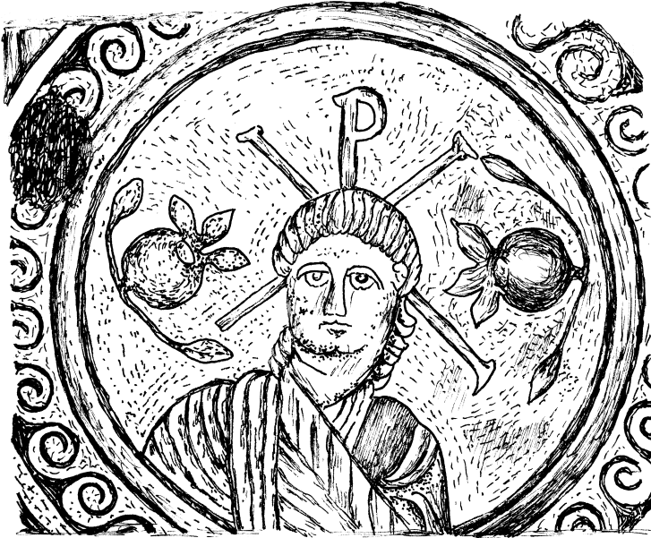
Figure 1.2 Christ with the labarum and two pomegranates, symbols of immortality, in the Roman villa at Hinton St Mary (Dors).

That some form of hierarchy existed in the fourth century is evident from the attendance of British bishops at the Council of Arles in 314, but it is not clear whether Britain was represented at subsequent councils before that of Rimini in 360. 27 The British church would thus appear to have been patterned on the continental model, with bishops presiding in at least some of the cities and exercising a kind of spiritual jurisdiction over their dependent civitates or regions. But we have absolutely no knowledge of what happened at a lower level or of how urban churches were organised. Under the Roman Empire Christianity seems largely to have been a religion of the rich landowners, and it was this class which collapsed when the social and economic world of Rome disappeared. 28 It seems never to have had the mass appeal such as it gained in Gaul from the time of Martin of Tours. Certainly there is no evidence which in any way foreshadows the future parochial system.