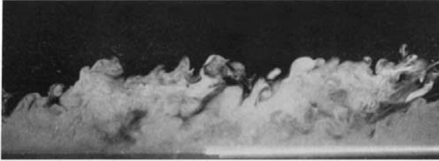
Fig. 1.2. Turbulent Boundary Layer (after van Dyke, 1975).

answered. It should be clear that the actual causes of any resulting instability will vary as well.