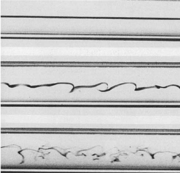
Fig. 1.3. Reynolds Pipe Experiment (after Drazin & Reid, 1984).

the turbulent state. Contrary to this, a case where a benefit from turbulent flow would be desired over laminar is mixing, for example. The goal of predicting or even approximating the process of transition has been a stated goal throughout the history of fluid mechanics and, it was once thought, stability analysis would be able to do this. Any success has been limited but stability analysis can explain – for almost all of the major cases – why a basic flow cannot be maintained indefinitely.