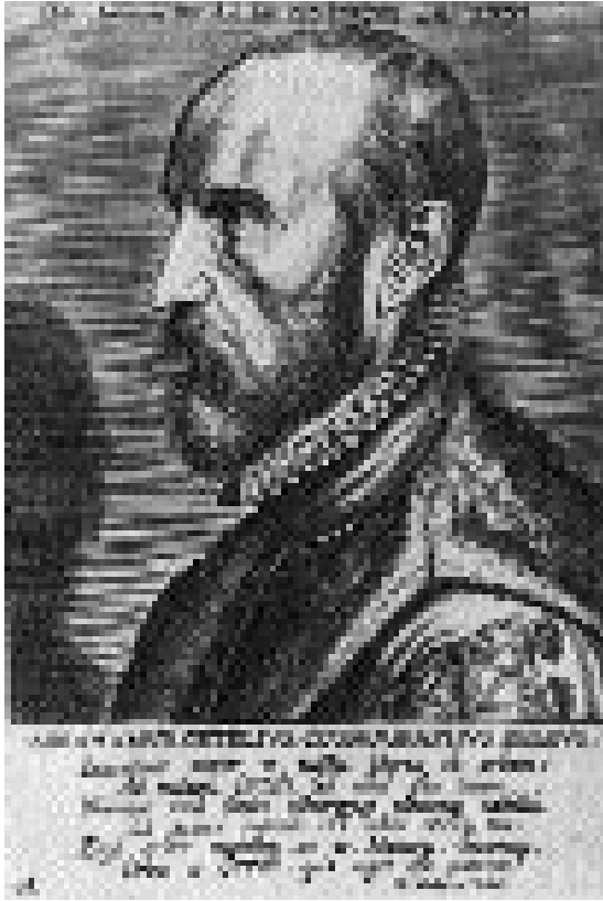
Fig. 15. Philips Galle. Portrait of Abraham Ortelius. Engraving.