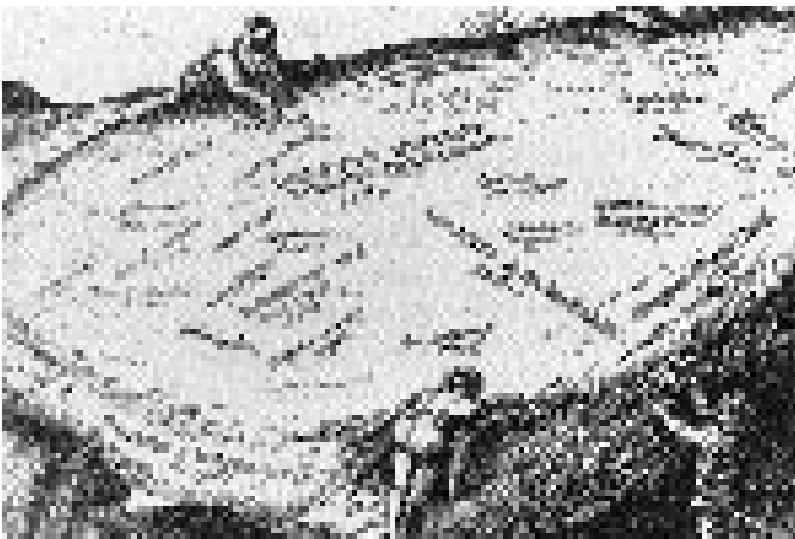
Fig. 17. Illustration to G. Braun, Civitates orbis terrarum, vol. 5, Antwerp and Cologne, 1597. The pierre levée outside Poitiers. Detail. Engraved by Frans Hogenberg after Joris Hoefnagel.