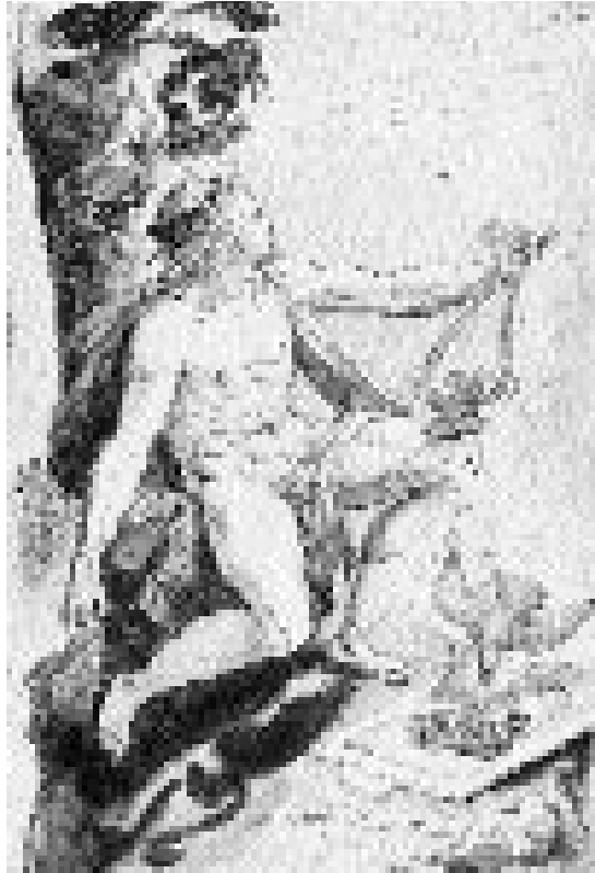
Fig. 18. Marten de Vos. Apollo. Drawing in Album Amicorum Johanni Viviani. 1579.

would concede “that a wise man must keep silent in these days,” and “that Christianity which imposes us to believe this or that has nothing to do with Christianity.” 63 In the alba amicorum of both Ortelius and Vivien, the engraver Philips Galle drew for his friends a bust-length picture of Christ. “What could I better give you?” the author asked rhetorically, for the image of Christ as reminder of His exemplary life pointed to the essence of their faith. 64