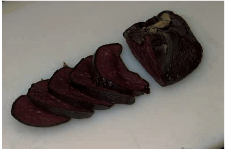
Fig. 1.4. Partly sliced spleen demonstrating the preparation of complete horizontal cross-sections through the organ at 0.5 to 1 cm intervals.

If it is unavoidable that a spleen is sent to the laboratory in fixative, it should be measured, described, sliced and fixed further as