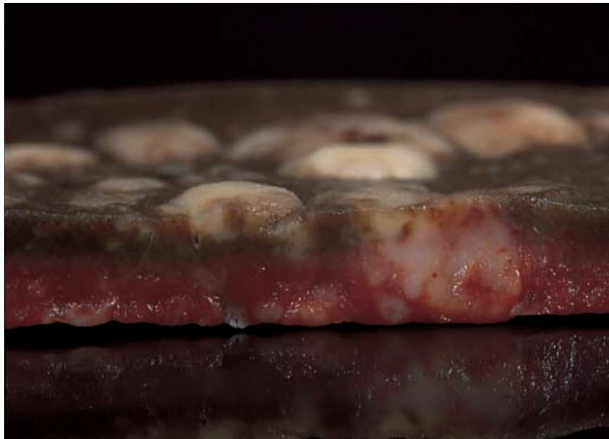
Fig. 1.3. Slice of tissue prepared from a spleen which had been received fresh and sliced at 1 cm intervals prior to immersion in formalin. Twenty-four hours later, each portion of spleen was re-sliced at 5 mm thickness. A cross-section through one such piece is shown. This photograph emphasizes the slow penetration of formalin into splenic tissue, even after appropriate initial handling of the organ.

Normal spleens from experimental animals and spleens obtained at defined time-points following immunological challenge or injury in such animals offer insight into splenic pathophysiology. However, the anatomy and functions of the spleen differ considerably between species, and data