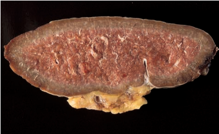
Fig. 1.1. Slice of spleen showing the effects of partial fixation following immersion of the intact organ in formalin for 24 hours. Subcapsular tissue is reasonably well fixed to a depth of approximately 5 mm in this example, but the central parenchyma remains unfixed.