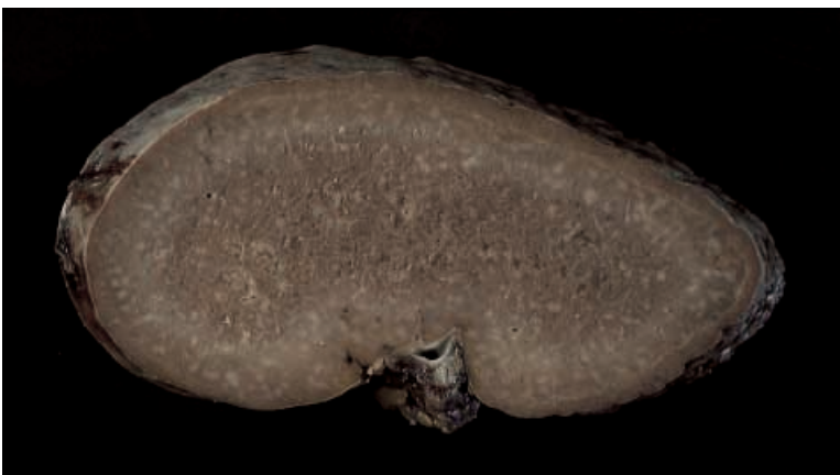
Fig. 1.2. Slice of spleen, similar to that in Fig. 1.1, showing the effects of further fixation for 24 hours after slicing, the spleen having been received unsliced, immersed in formalin. There is a clear line of demarcation between the original zone of fixation and the area of secondary fixation. Histology from the central area would be suboptimal, despite now appearing fixed.

Where the spleen has been removed primarily for diagnostic or therapeutic purposes, it can be very frustrating for the pathologist to find that there is apparently little correlation between any visible morphological abnormalities and the documented clinical disease. There may be little or nothing detectable in the spleen histologically which can be regarded as abnormal, or there may be obvious abnormalities which cannot be attributed with confidence to a specific cause.