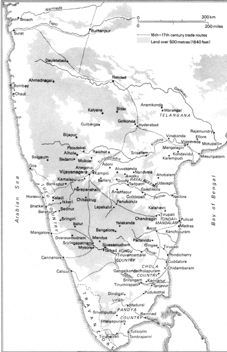
1 The southern peninsula, c. 1400-1500