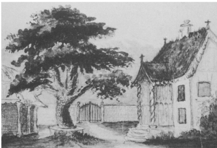
1 Water-color sketch by Ibsen from his Bergen years, perhaps meant for a rustic landscape setting.

with new and unconventional approaches to practical problems of stage arrangement. 5 The real significance of these notes, however, is as evidence of Ibsen's developing sensitivity to the importance of setting, lighting, and costuming as dramatic values – large-scale metaphors capable of concretizing the drama's theme and mood. Furthermore, of the hand-colored costume sketches and stage designs we are told he customarily prepared for his productions, enough iconographic evidence has survived to confirm this sense of Ibsen's decisive responsiveness to the visual aspects of theatrical expression. 6 The manner in which he utilized this visual component in his work would change radically – and more than once – during his career, but its central importance to his conception of a play never diminished.