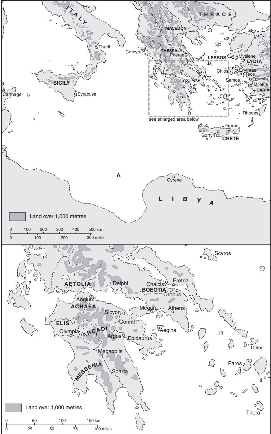
Map 1 The Greek World.