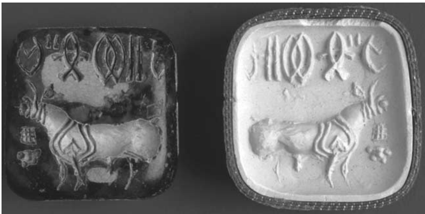
Figure 1.3. Major Clark's seal from Harappa reported by Alexander Cunningham.

The seal is a smooth black stone without polish. On it is engraved very deeply a bull, without a hump, looking to the right, with two stars under the neck. Above the bull there is an inscription in six characters, which are quite unknown to me. They are certainly not Indian letters; and as the bull which accompanies them is without a hump [like the traditional zebu cattle], I conclude that the seal is foreign to India. (1875:108)