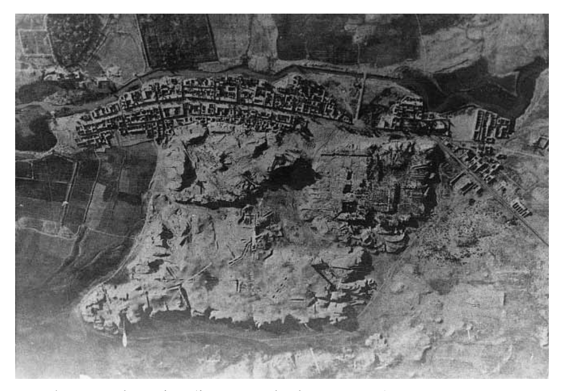
Plate 1.1 Aerial view of Susa.

1969: 54). Although the nineteenth century witnessed the documentation of numerous trilingual Achaemenid inscriptions (Pallis 1954: 52–3), as well as many attempts at their decipherment, the Elamite versions of these texts were not satisfactorily deciphered until 1890 when F.H. Weissbach published his PhD dissertation on them (later appearing in revised form as Weissbach 1911).