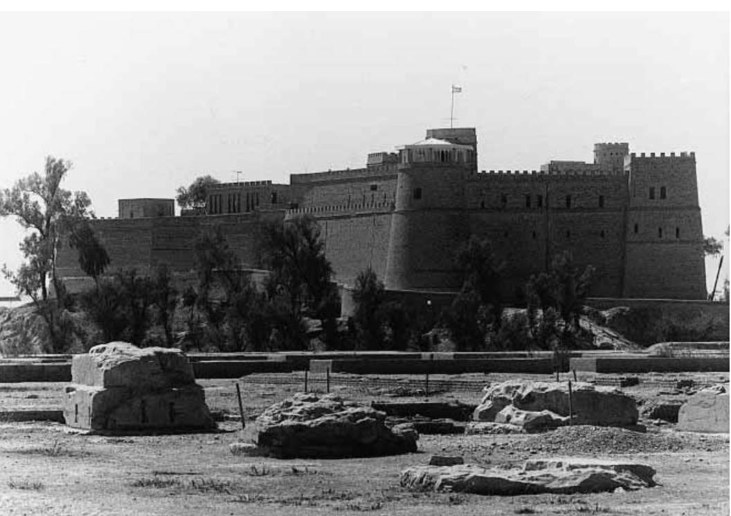
Plate 1.2 Château Susa, the fortified excavation house begun on the Acropole by Jacques de Morgan in 1898.

Artaxerxes II (404–359 BC) – identified by some with King Ahasuerus of the Book of Esther (other scholars believe Biblical Ahasuerus to have been Xerxes, e.g. Heltzer 1994) – mentioning the palace of Darius which had burned in the lifetime of Artaxerxes I as well as the new palace built by Artaxerxes II, there was no longer any doubt about the identity of modern Shush and Biblical Shushan (Curtis 1993: 22, 31–2), and indeed this was the basis for the resumption of investigations at the site by the French expeditions (Dieulafoy 1888; 1893; see also Harper, Aruz and Tallon 1992: 20–4) of the late 19th century (Pl. 1.2).