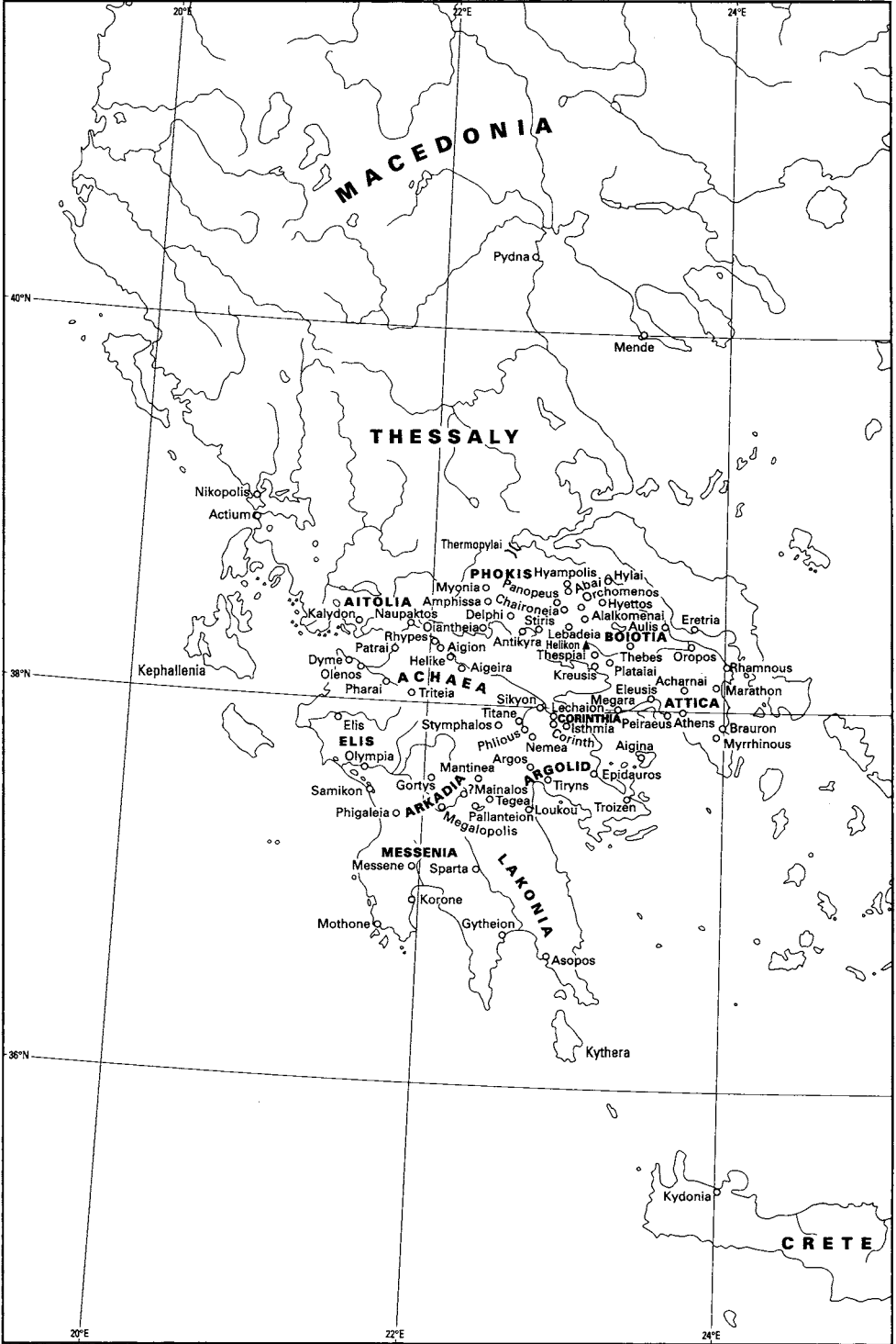
Map of Roman Greece