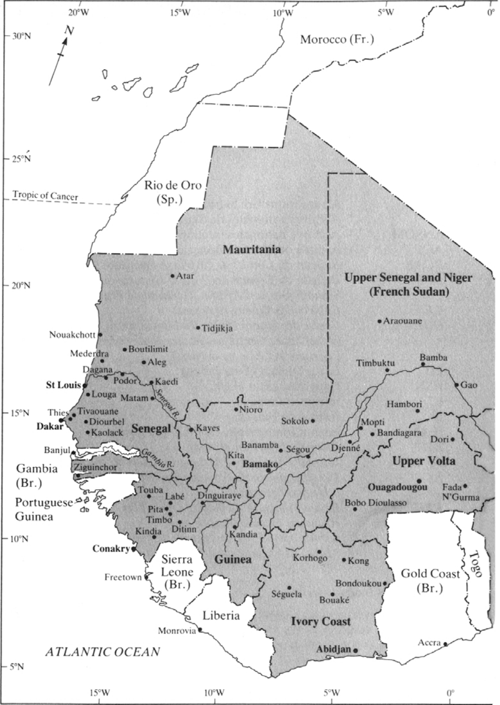
North West Africa, c. 1930.