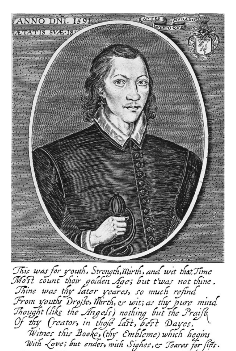
Figure 1 Donne in 1591; from an engraving by William Marshall, prefixed to Poems, 1635.