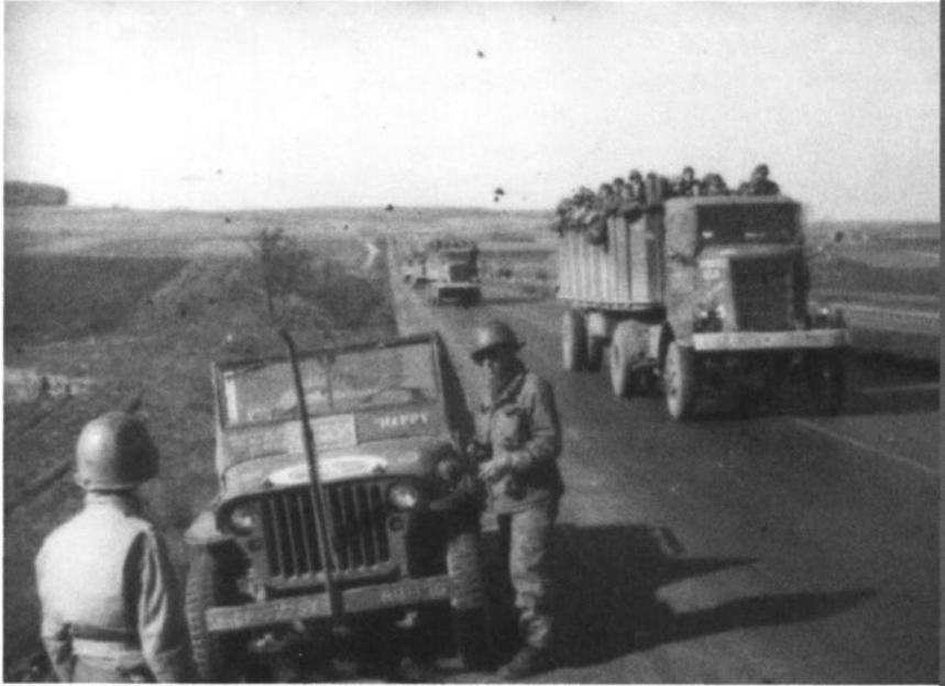
Germany, 1945

Cambridge University Press 978-0-521-53751-3 - Conquerors' Road Osmar White Frontmatter More information