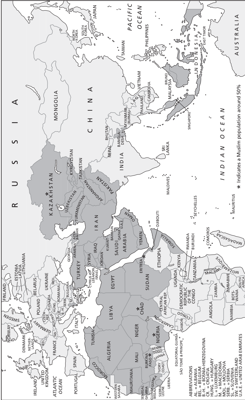
Map 1 Countries with majority Muslim populations