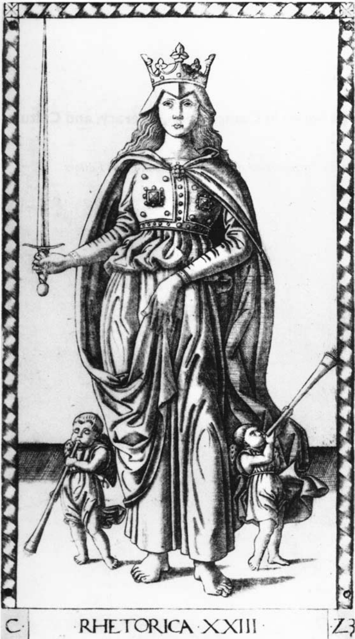
Figure 1.2 This image of Rhetorica is from a set of fifty engraved prints depicting various entities, including the seven liberal arts. Although the engraved cards are usually called the Mantegna Tarot, they are actually not Tarot cards, nor are they most likely by Mantegna. The unknown artist is generally agreed to be Italian, and the engravings were created about 1465. Many of the surviving cards are in poor condition.