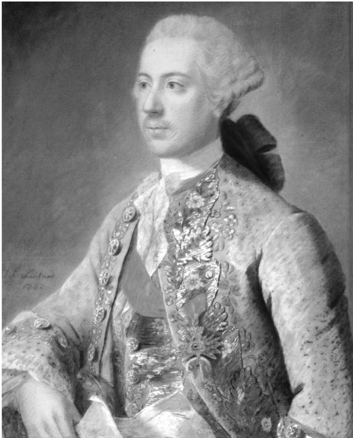
Frontispiece Joseph, 1762. J. E. Liotard, pastel, collection of prince Schwarzenberg. The archduke is shown wearing a rich civilian habit habillé such as he seldom wore in later life.