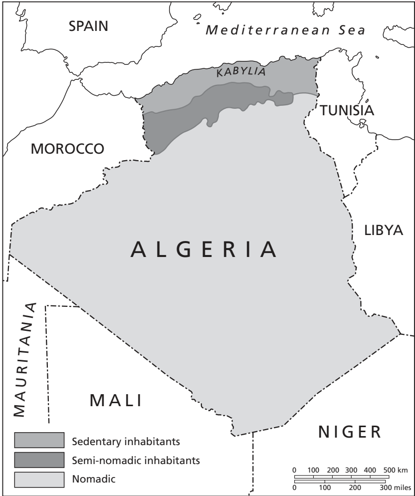
Settlement patterns in late nineteenth-century Algeria