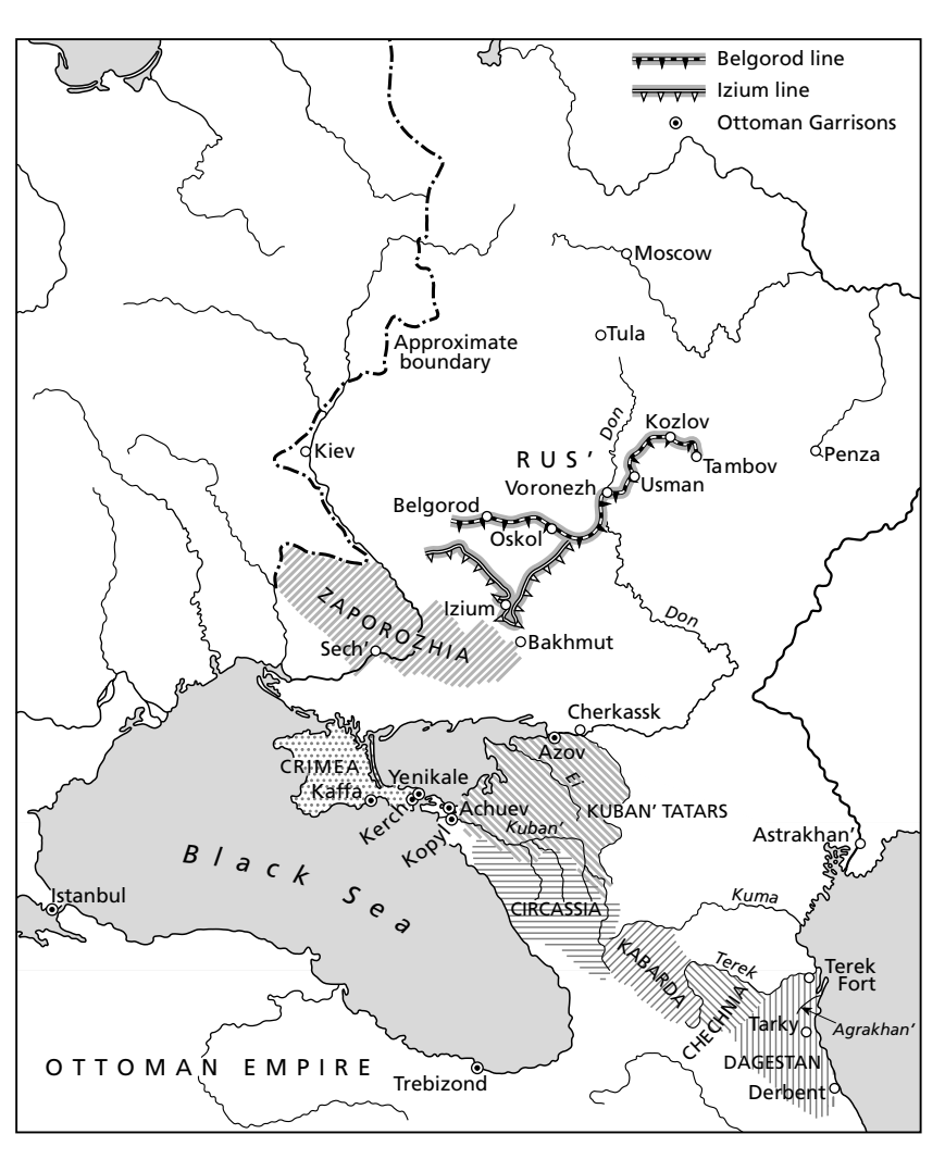
2. The wider world of the Don steppe frontier