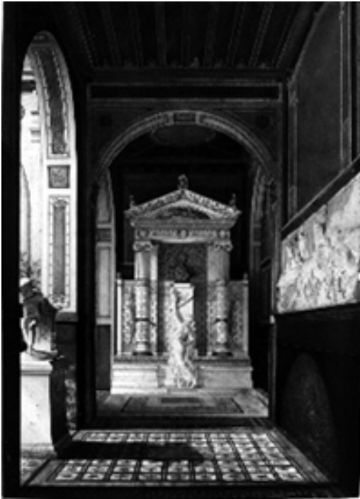
Figure 7. Vue du monument à Regnault dans la cour du Mûrier à l'École des Beaux-Arts (view of the monument to [Henri] Regnault in the cour du Mûrier at the École des Beaux-Arts), 1877; Pascal and Coquart, architects, Chapt and Degeorge, sculptors.

highlighted with deeper blues and reds, works to keep the eye on the key architectural feature. The program had required that there be enough room on the dais for two attendants to robe the bishop. Cret disposed them asymmetrically, and in postures that gently animate the formal composition and the rituals of the Church.