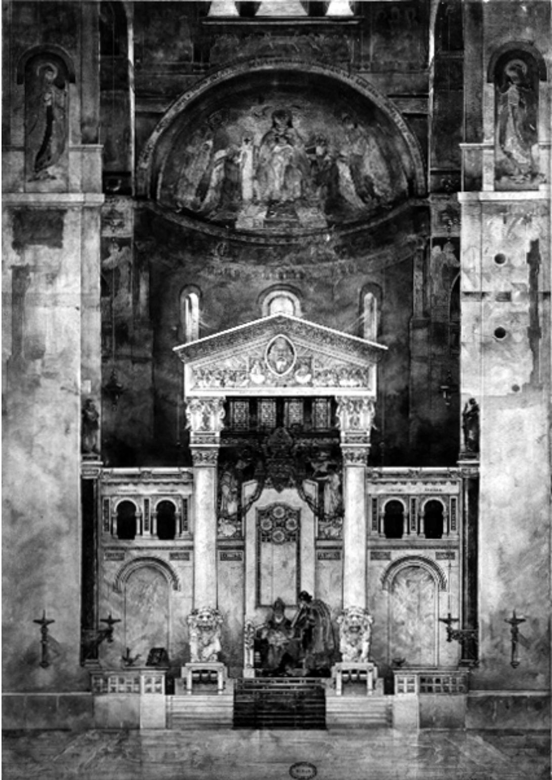
Figure 10. Paul Philippe Cret. "Un Trône épiscopal" (an episcopal throne), Prix Rougevin, 19 Feb 1901. (Paris, École Nationale Supérieure des Beaux-Arts.)