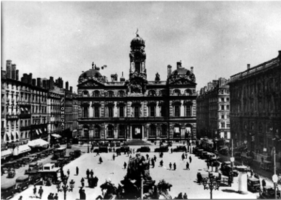
Figure 1. Place des Terreaux – Hôtel de Ville, Fontaine Bartholdi, and Palais des Arts – Lyon. (Photo: c. 1920, reproduction by J. Gastineau; Archives Municipales de Lyon.)

of fine-arts education. 14 Lyonnais architects objected to the fact that Paris alone was able to give students dispensation from two years of military service and, more important, to offer the architectural diplôme , the second most important professional credential an architect could have (the first being the Grand Prix de Rome, which theoretically was open to any Frenchman).