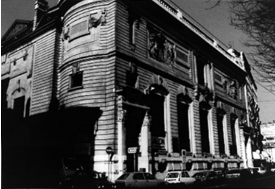
Figure 3. (above) Eugène Hugué. Palais Municipal des Expositions et Conservatoire, quai de Bondy, Lyon, 1902–4; facade.