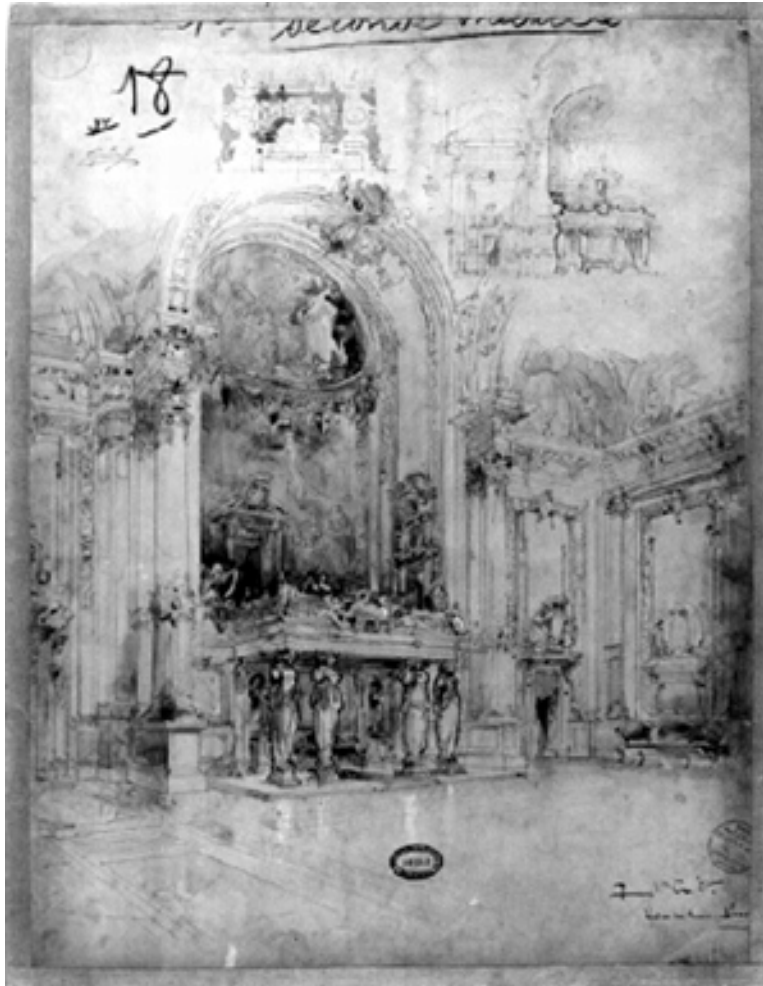
Figure 11. Paul Philippe Cret. "Une Tribune dans une salle de fêtes" (a mezzanine in a room for formal social gatherings). Esquisse de 1 ère classe, 1 ère seconde médaille, 11 October 1900. (Paris, École Nationale Supérieure des Beaux-Arts.)

with which the drawing was done – in twelve hours en loge (Fig. 11). The delicate cascade of ink lines, with splashy accents of blue and gold, appears vaguely baroque, vaguely rococo, even, because of the asymmetry of the acute perspective, vaguely art nouveau; in short, a witty confection of styles suggestive of elegant events. 58 He received a 1 ère seconde médaille in this concours in 1900.