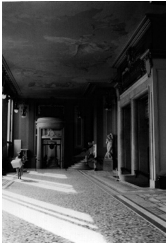
Figure 4. (right) Eugène Hugué. Palais Municipal des Expositions et Conservatoire; vestibule d'honneur.