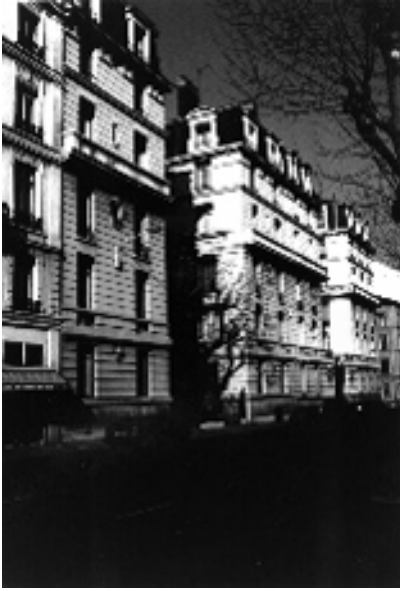
Figure 5. (above) Eugène Huguét. Maisons à loyer , 7–9, rue de Bonnel, Lyon, 1895–7; facades.