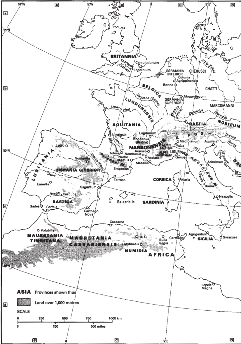
Map 2: The Roman empire at the time of the Julio-Claudian emperors