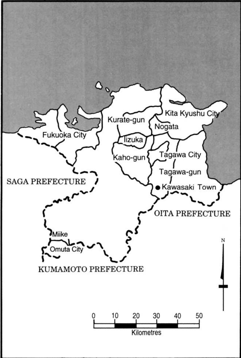
Map 2: Fukuoka prefecture and Chikuho region

Cambridge University Press 978-0-521-45009-6 - Undermining the Japanese Miracle: Work and Conflict in a Coalmining Community Matthew Allen Frontmatter More information