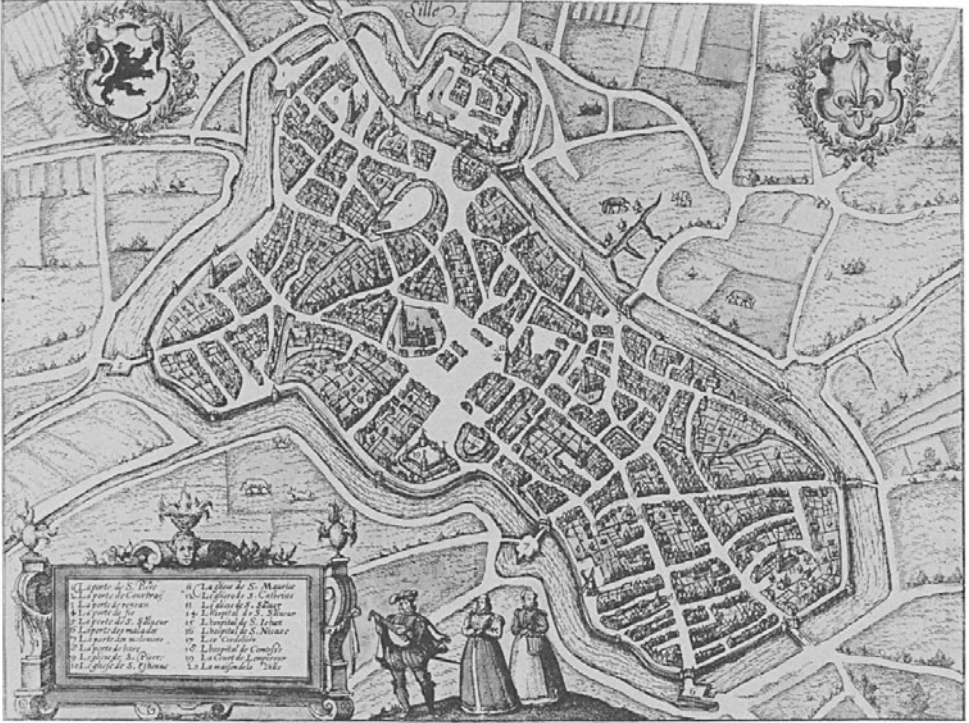
The City of Lille. Engraving from the sixteenth century. Lille, Musée de l'Hospice Comtesse.