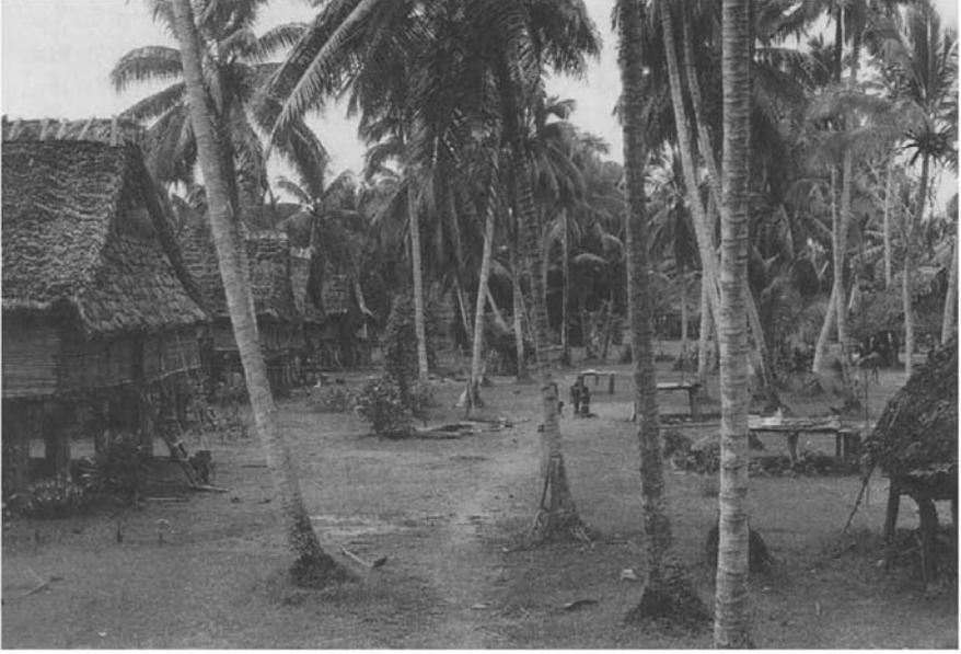
The ward of the subclan Maliyaw at Yentshinggai.