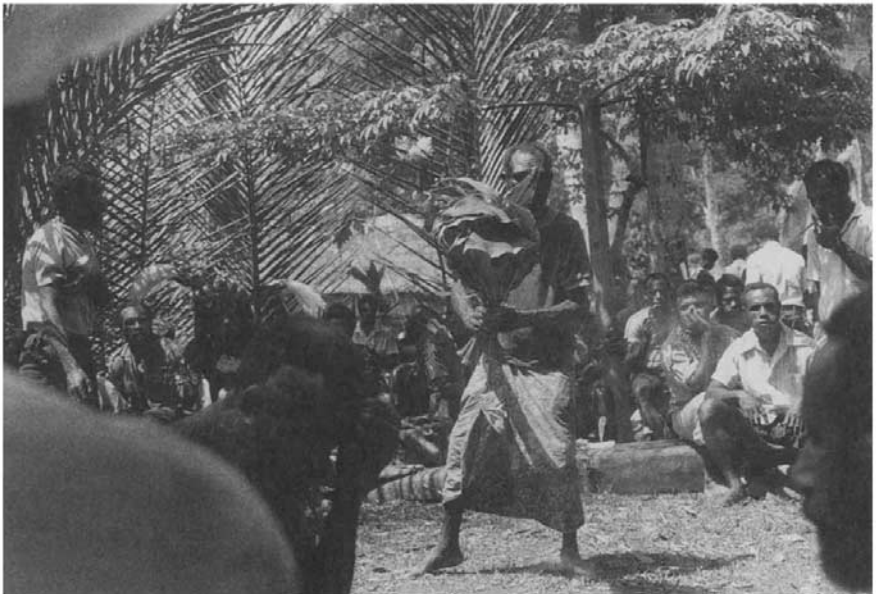
Debating the ownership of the name Kōrekōndawai, Malu village, April 1978.