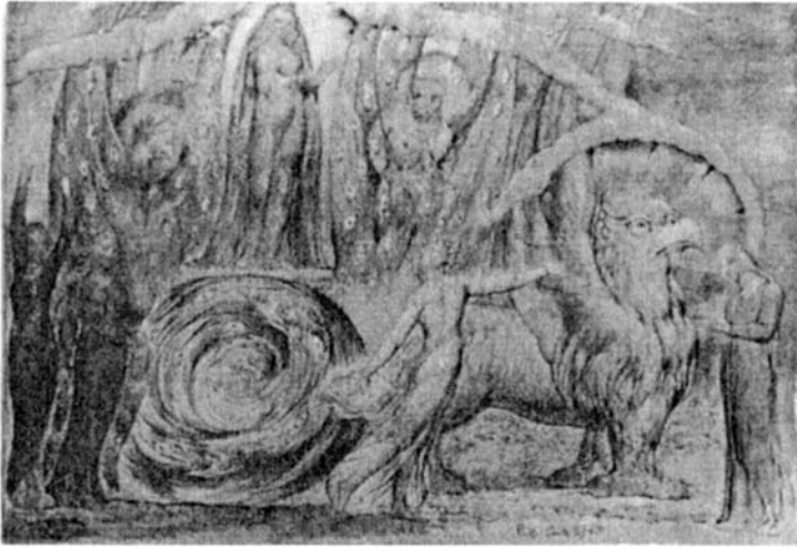
Beatrice addressing Dante from the car by William Blake (reproduced by permission of the Tate Gallery, London)