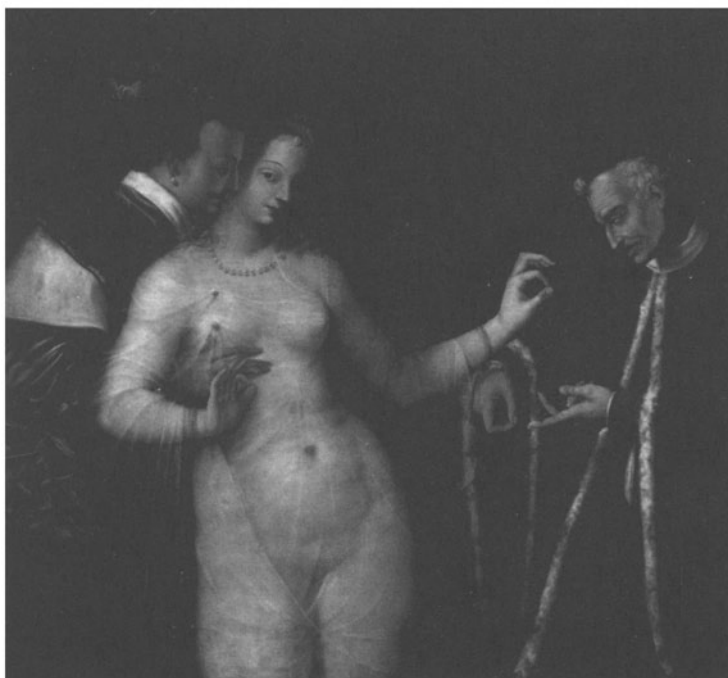
“La Femme entre les deux âges,” an anonymous sixteenth-century painting of the School of Fontainebleau. Reproduced by permission of the Musée des Beaux-Arts de Rennes.