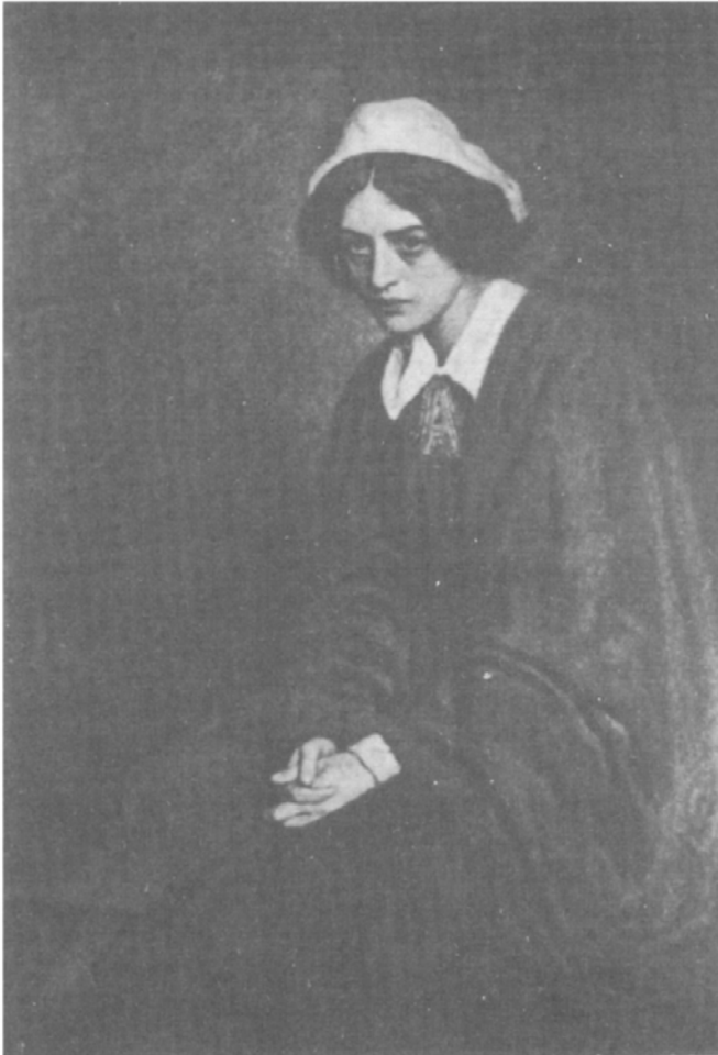
Hester Prynne: a painting by Sigismond De Iranowski for The Century Magazine , 1912.