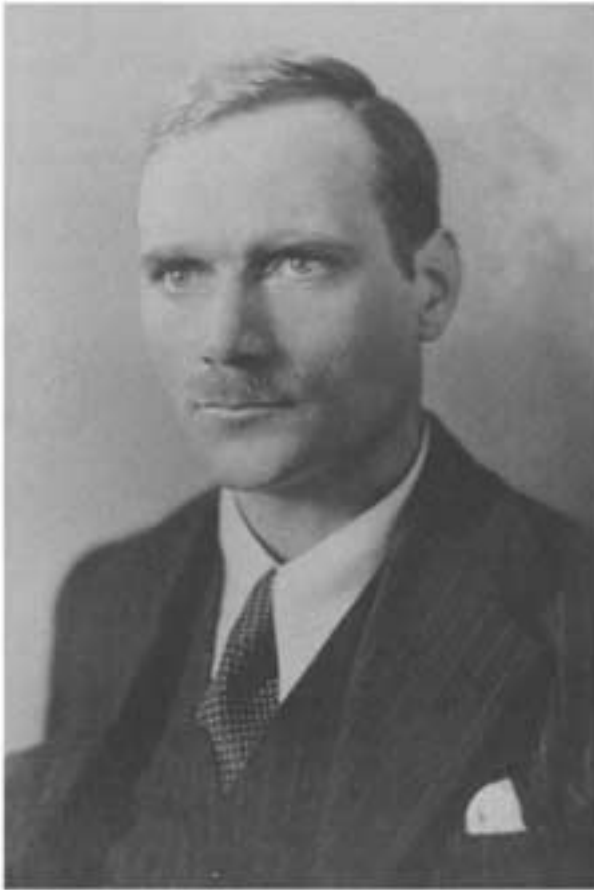
Figure 1. The young John Grierson.

in which Scots passion for proselytizing found expression through the new techniques of mass persuasion. In the case of John Grierson, it is equally clear that ideas and an outlook forged within the Scottish intellectual and religious tradition were reshaped by first hand experience of developments in publicity and public relations in the United States.