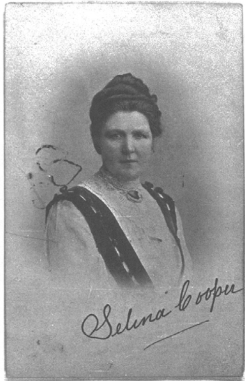
Selina Cooper, suffragette and socialist, c. 1910–1912. Taken from a postcard, 'Make no more Grants Oh Lord/ But elevate the Race at once'.