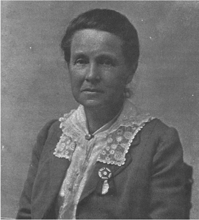
Millicent Fawcett, c. 1915.