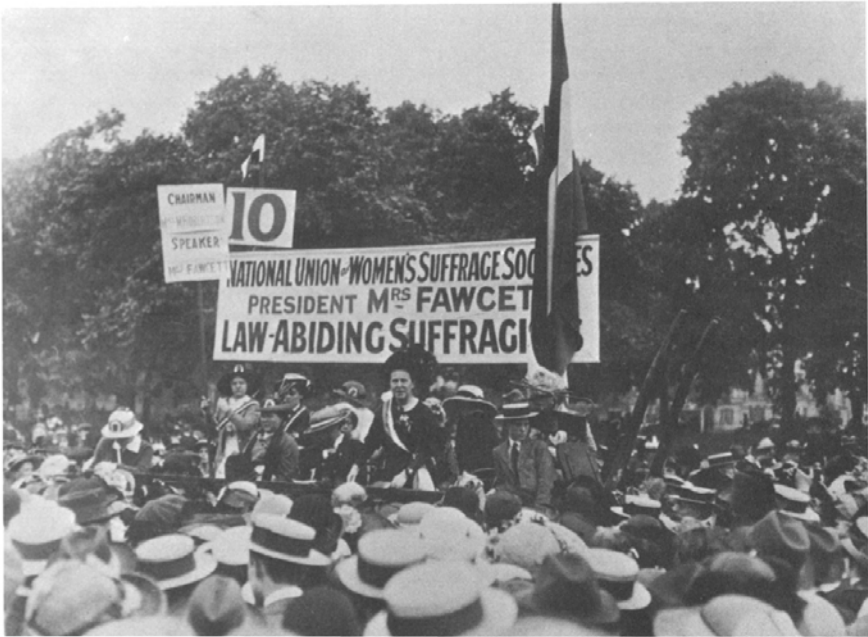
Suffragette rally, Hyde Park, 1913. 'Millicent Fawcett addresses a meeting'.