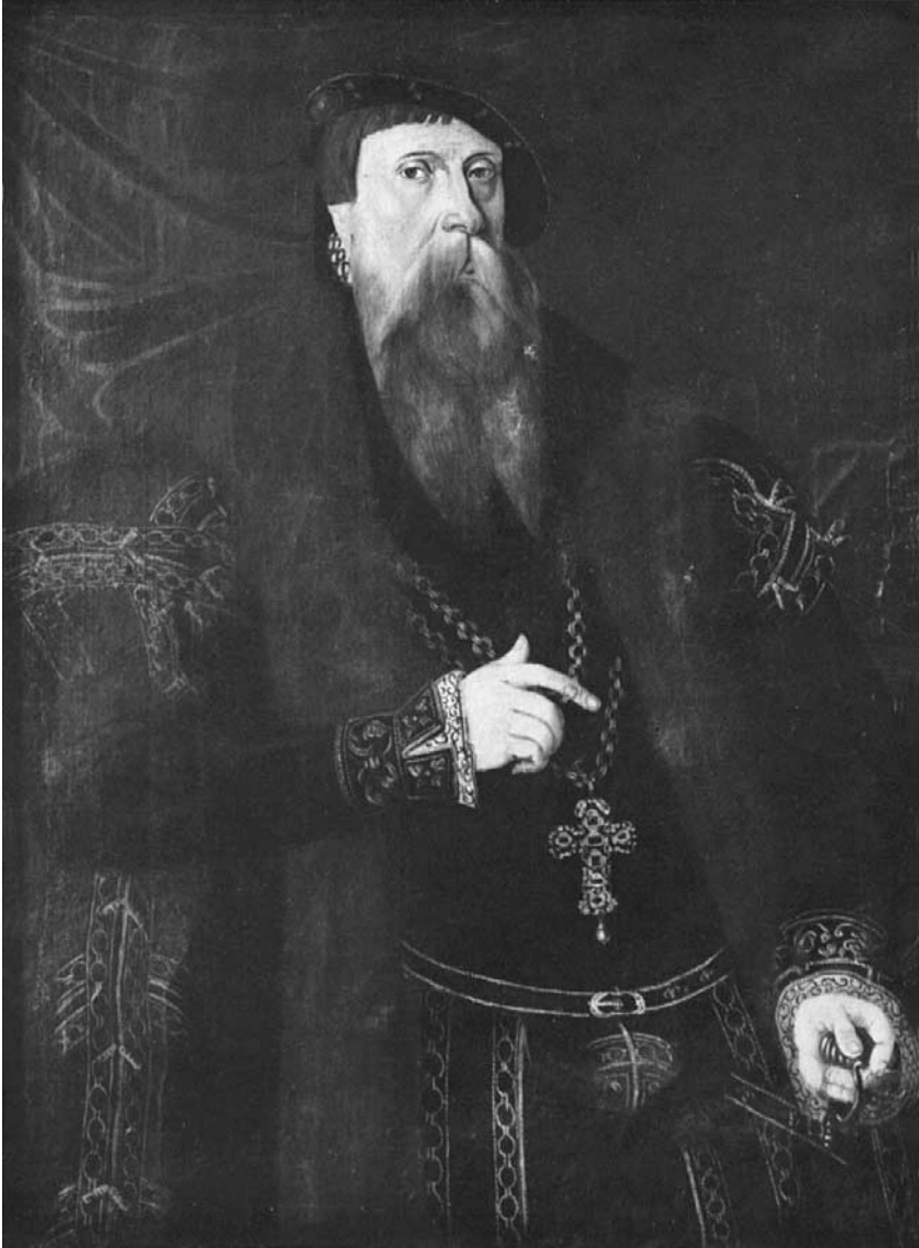
GUSTAV VASA IN OLD AGE