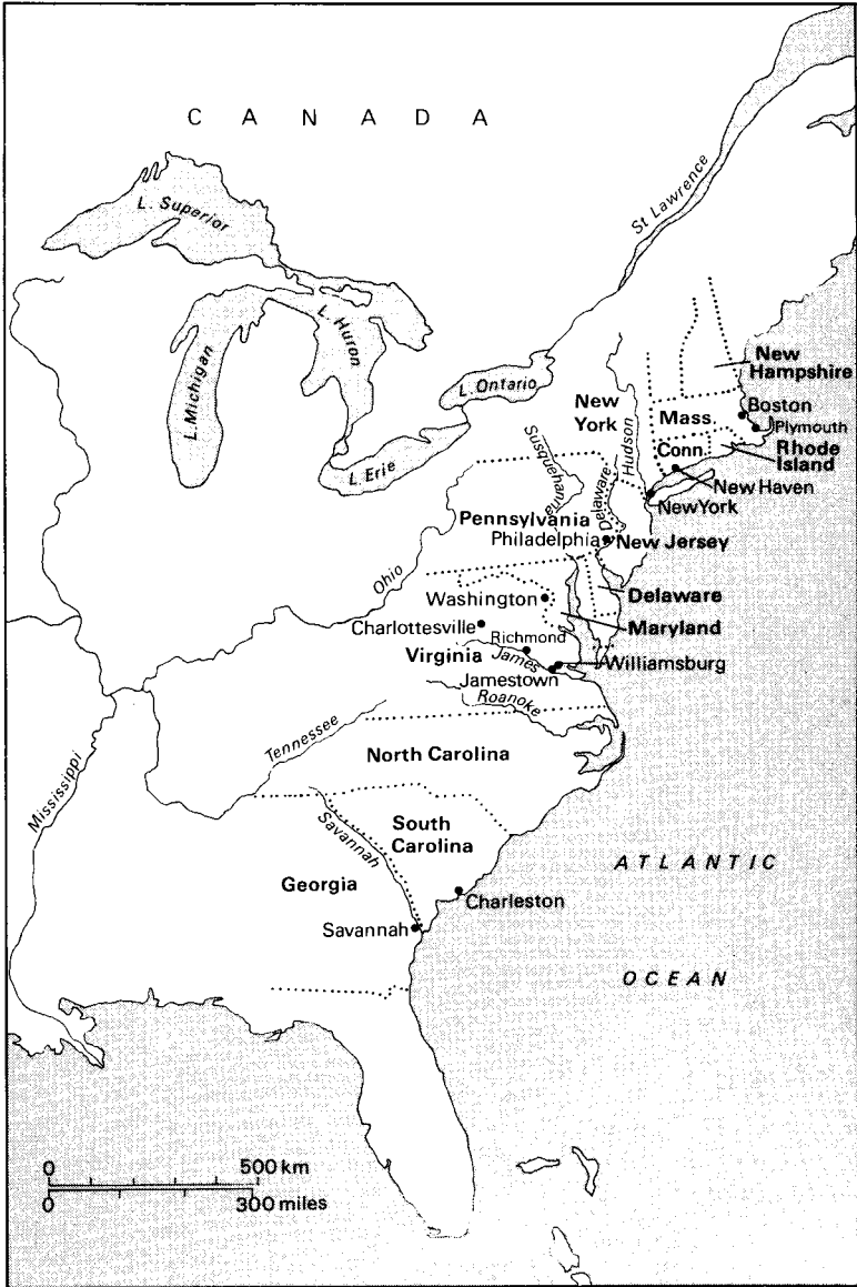
British in Eastern North America 1603–1763 (before Treaty of Paris)