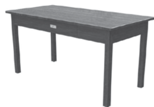
7 a t _____