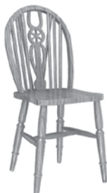
2 a c _____