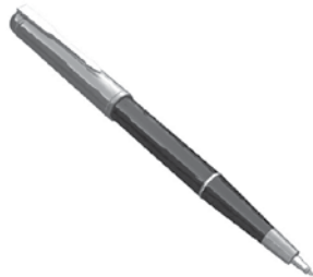
4 a p _____