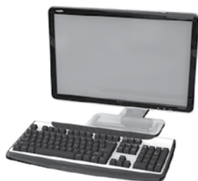
5 a c _____