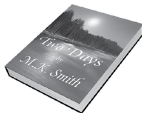
6 a b _____