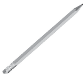
10 a p _____