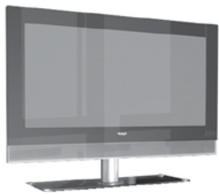
1 a T V