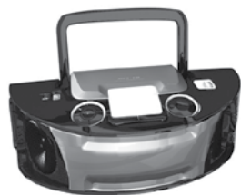
9 a C _____ p _____