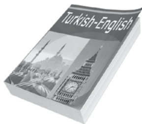
8 a d _____