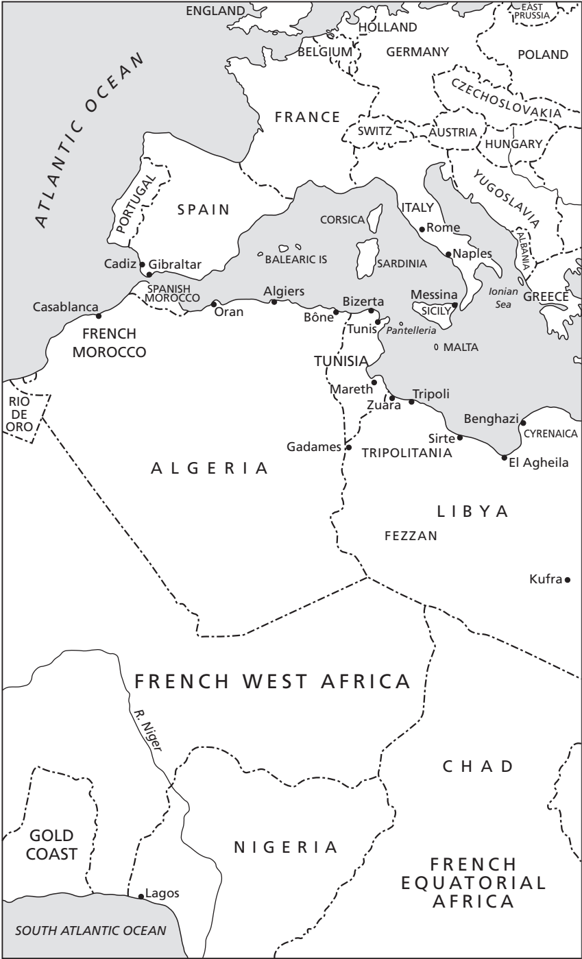
2 The Middle East theatre of war. Kitchen, Rommel's Desert War