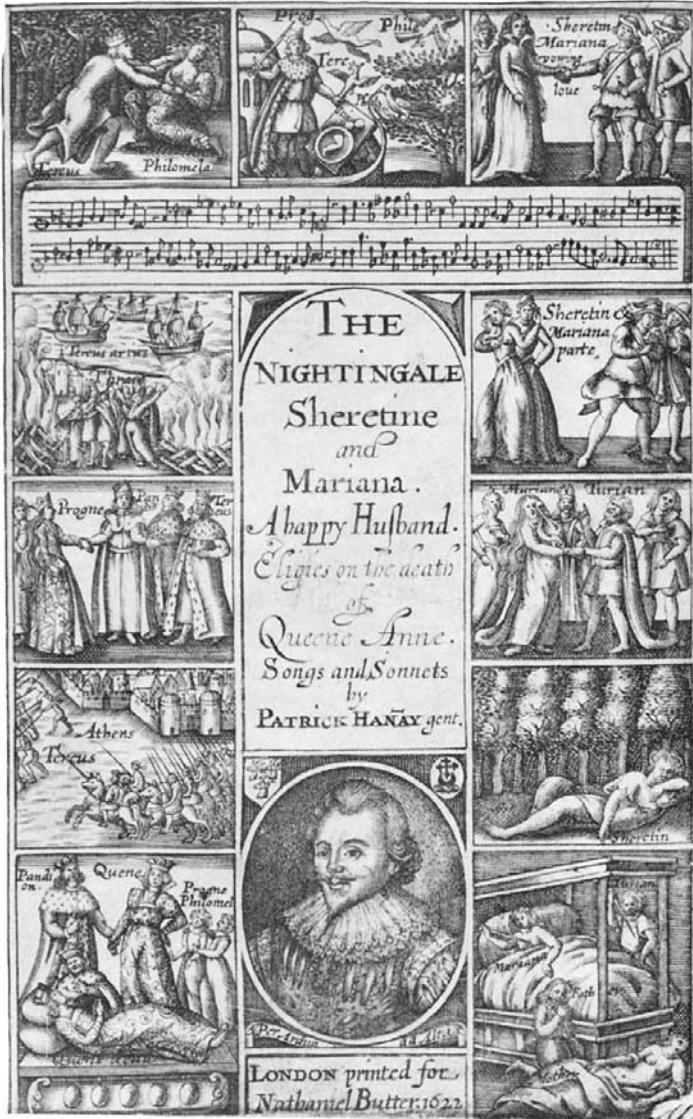
Title page of Patrick Hannay's Philomela (London, 1622)