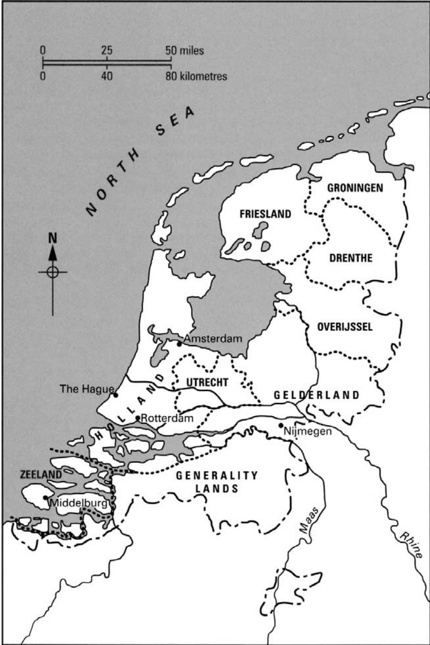
The Republic of the Seven United Provinces