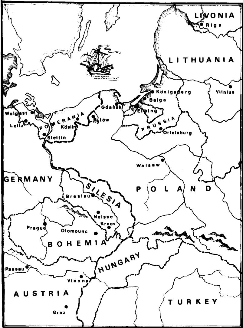
1. Towns visited by English players in Central and Eastern Europe