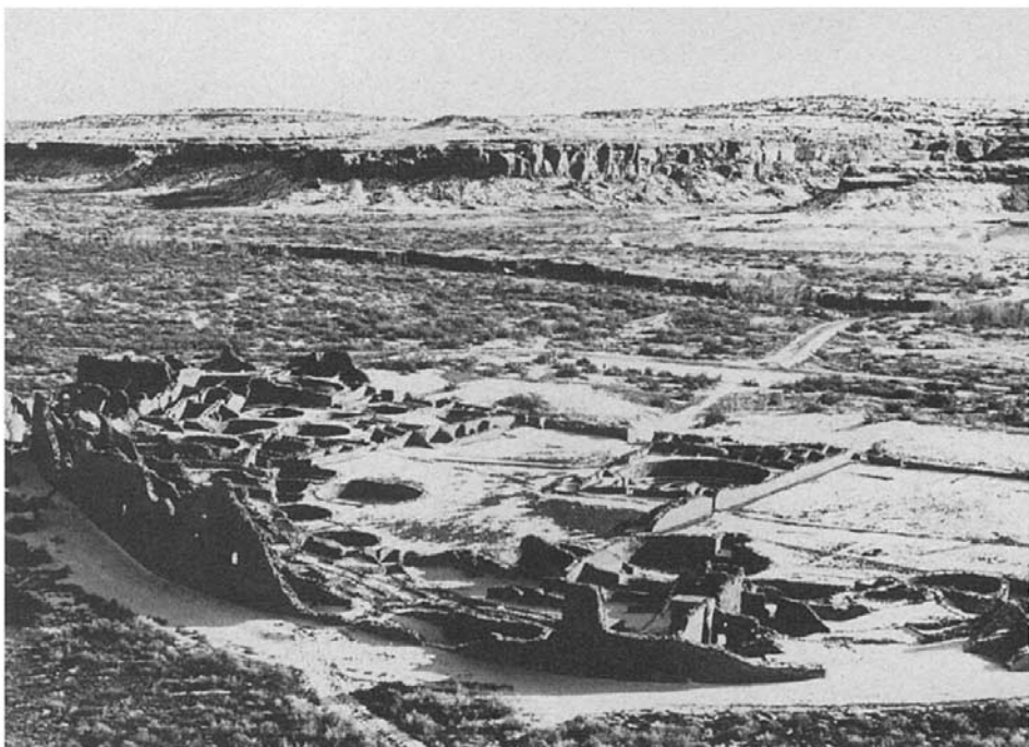
Fig. 1 The large Anasazi site of ‘Pueblo Bonito,’ in winter, Chaco Canyon, New Mexico. Large settlements in this area were among the first in the Southwest to be abandoned prior to 1400 C.E. (courtesy J. S. Athens).

Such questions were partially answered by field studies among the extant primitive tribes living in the same area (e.g., Matthews 1882; Stevenson 1894). This early