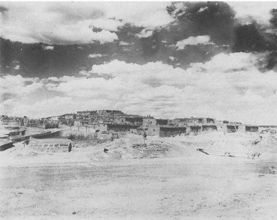
Fig. 2 Zuni Pueblo, New Mexico, as it appeared in the late 1800s. The inhabitants of the Zuni area are thought to have originated in the Mogollon region to the south (from Stevenson 1894, Plate 1).

Systematic exploration and documentation of prehistoric Indian ruins and artifacts occupied Southwestern archaeologists for the ensuing half century and more. In addition to obtaining numerous museum specimens, this research filled in