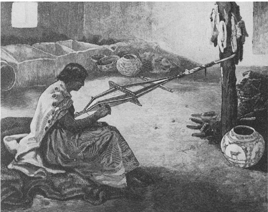
Fig. 3 Room interior, Zuni Pueblo, from a lithograph made in the late 1800s (from Matthews 1882, Plate 37).

From this sustained effort at prehistoric documentation, the imagined past appeared full of conventional but occasionally idiosyncratic behavior on the part of various primitive bands. A major prehistoric cultural entity or tradition gradually was recognized by these workers, the ‘Anasazi’ (meaning ‘ancient ones’ in the language of the Navaho tribe now living in the same area). The prehistoric Anasazi had dwelled mainly in the arid tablelands of the present states of Arizona, New Mexico, and Colorado. As more data came in from excavations and surveys, another major cultural tradition was named and defined, the ‘Mogollon.’ Mogollon territory had included the mountainous central portions of Arizona and New Mexico (for detailed summaries of these traditions see Wheat 1955; Willey 1966; Martin and Plog 1973; Ortiz 1979; Stuart and Gauthier 1984; and the site reports referenced in later chapters).