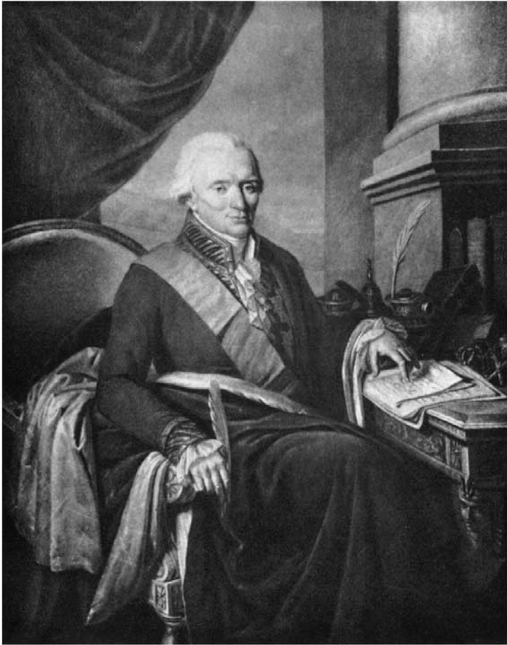
Prince M. M. Shcherbatov c. 1790 (N. de Courteille)