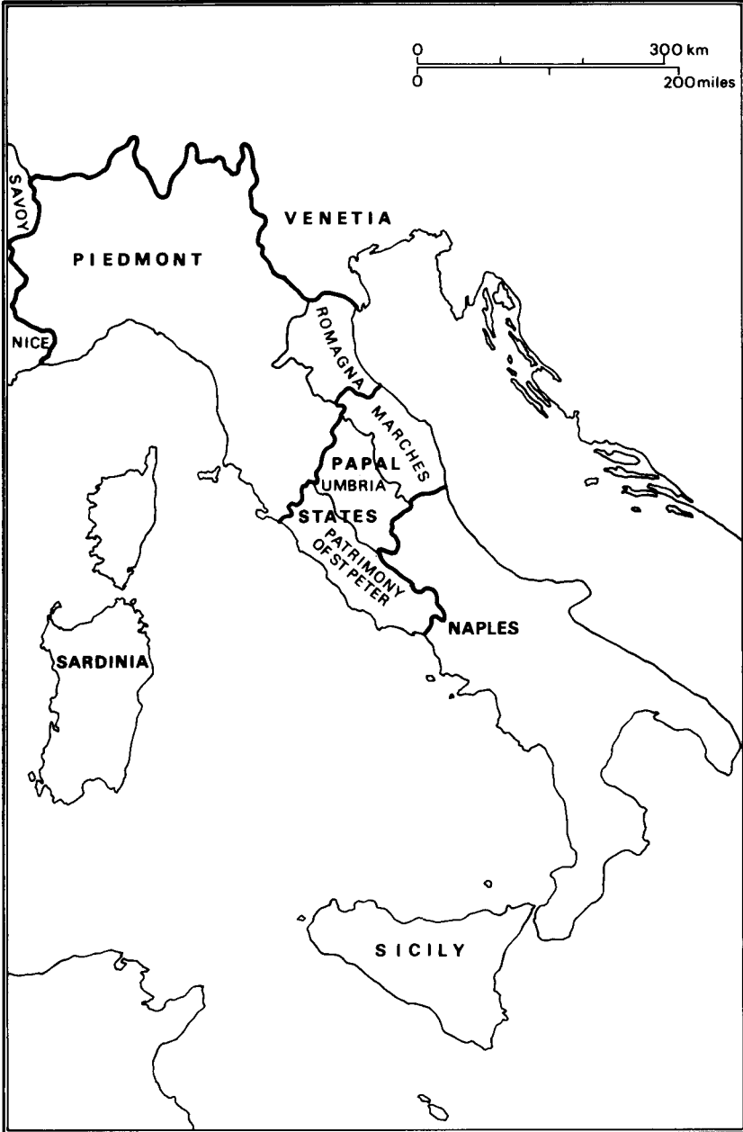
Map 3 Italy: after March 1860