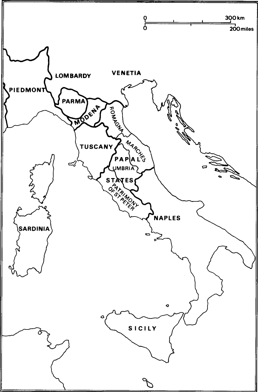
Map 2 Italy: December 1858