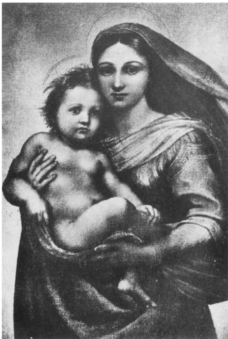
Copy of Raphael's 'Madonna di San Sisto', taken by Positivists as a symbol of Humanity, LPS 5/4