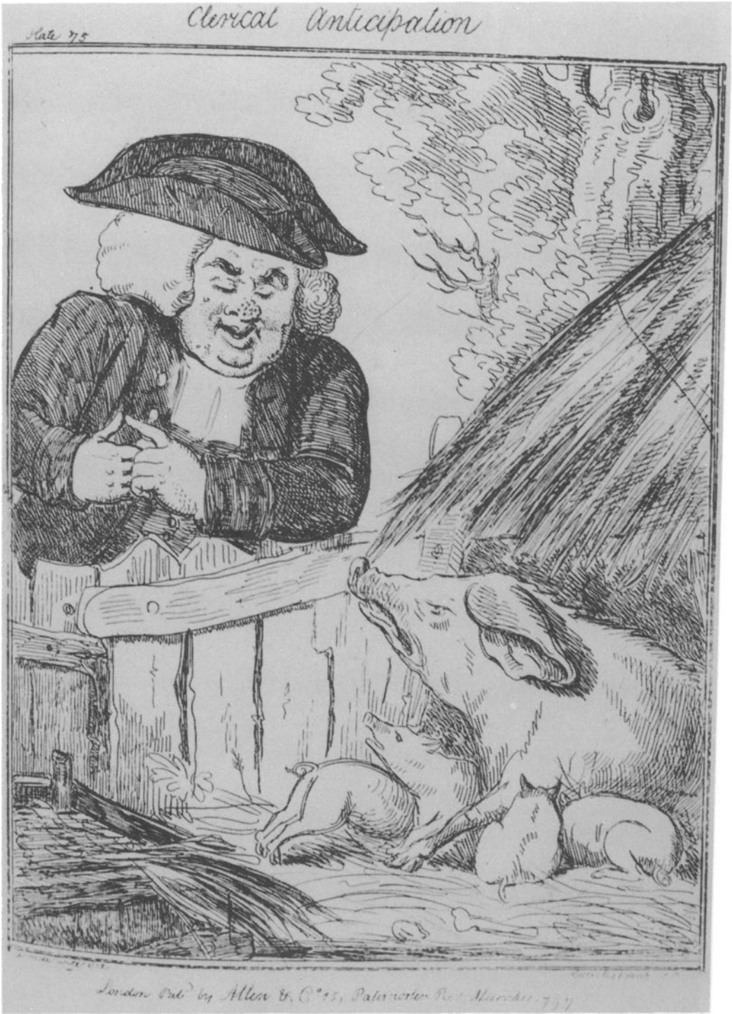
‘Clerical Anticipation’. Cartoon by Cruikshank, published by Allen & Co., London, 1797 (see pp. 1–2).