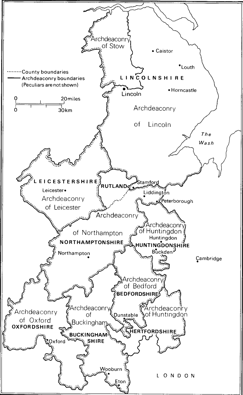
2. The diocese of Lincoln in 1521