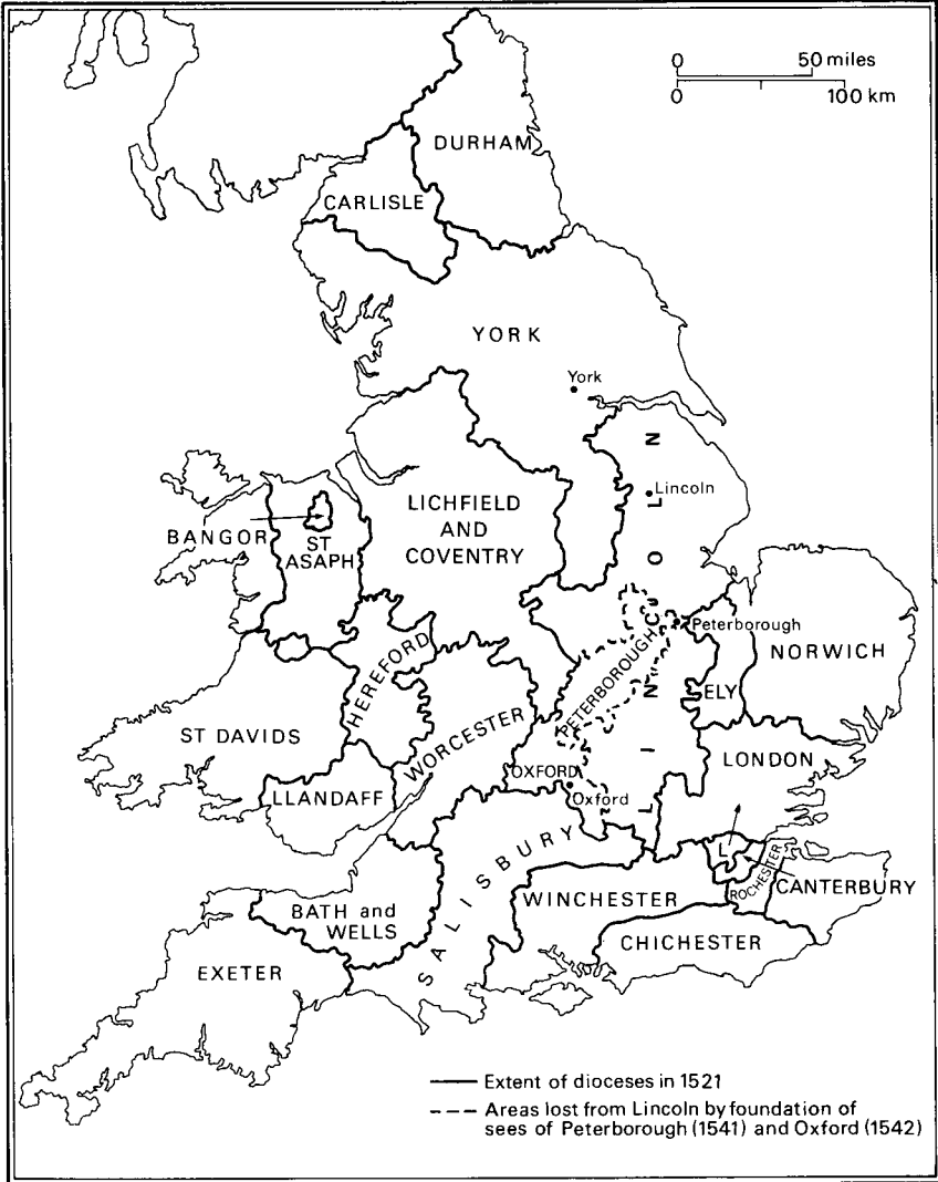
1. The dioceses of England and Wales in 1521