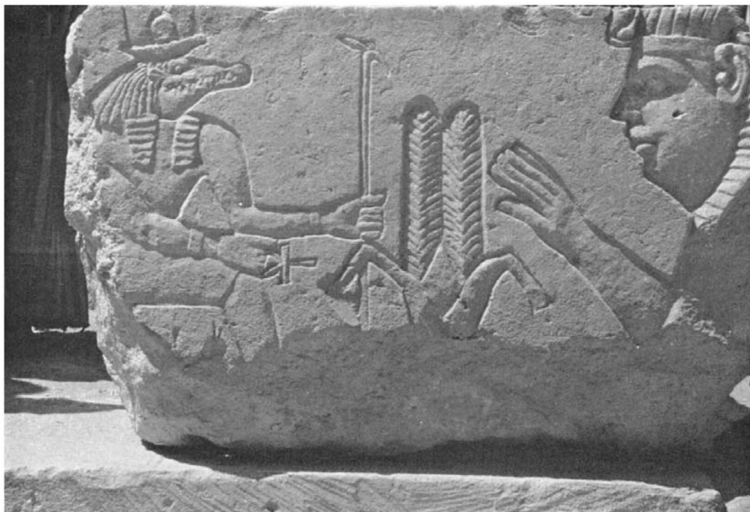
The two cultures—a stone from Tebtunis