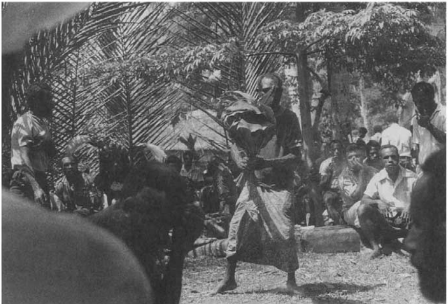
Debating the ownership of the name Kerekəndawai, Malu village, April 1978.