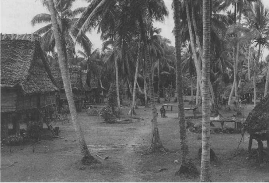
The ward of the subclan Maliyaw at Yentshinggai.