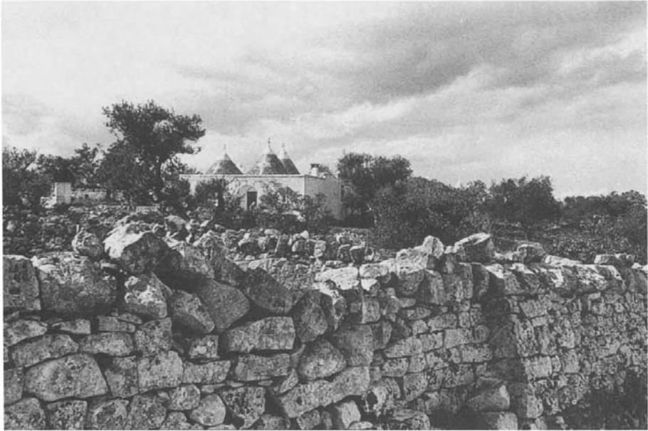
Stone wall and trullo