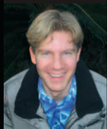
Bjørn Lomborg (editor)

In 2001, Lomborg was selected "Global Leader for Tomorrow" by the World Economic Forum . In 2002 Business Week named Bjørn one of the "50 stars of Europe". This year, he has been voted one of Time Magazine's "100 most influential people in the world today".