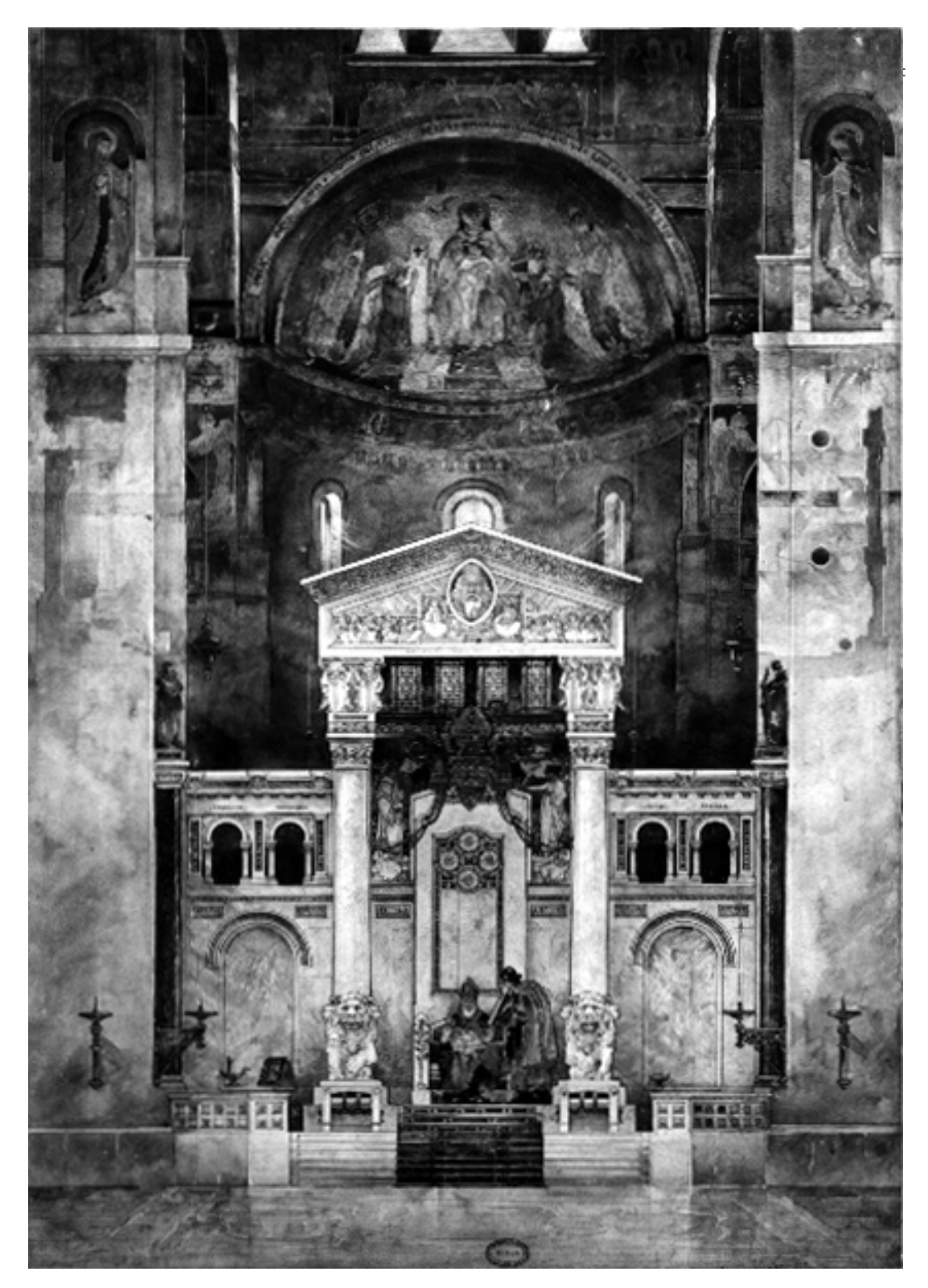
Figure 10. Paul Philippe Cret. "Un Trône épiscopal" (an episcopal throne), Prix Rougevin, 19 Feb 1901. (Paris, École Nationale Supérieure des Beaux-Arts.)