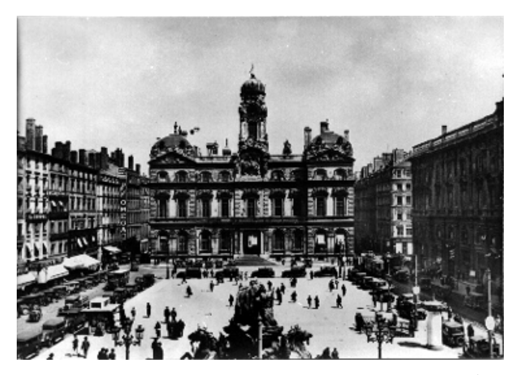
Figure 1. Place des Terreaux – Hôtel de Ville, Fontaine Bartholdi, and Palais des Arts – Lyon.

of fine-arts education.<sup>14</sup> Lyonnais architects objected to the fact that Paris alone was able to give students dispensation from two years of military service and, more important, to offer the architectural diplôme , the second most important professional credential an architect could have (the first being the Grand Prix de Rome, which theoretically was open to any Frenchman).