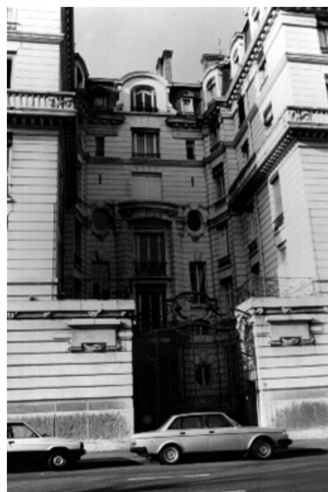
Figure 6. ( right ) Eugène Huguet. 9, rue de Bonnel, Lyon; facade.

could make known their interpretation of the present possibilities for the institution.