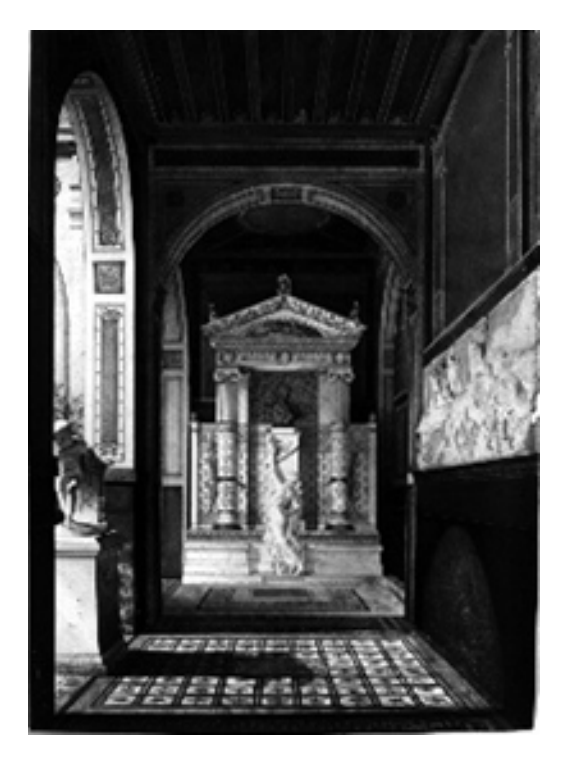
Figure 7. Vue du monument à Regnault dans la cour du Mûrier à l'École des Beaux-Arts (view of the monument to [Henri] Regnault in the cour du Mûrier at the École des Beaux-Arts), 1877; Pascal and Coquart, architects, Chapt and Degeorge, sculptors.

highlighted with deeper blues and reds, works to keep the eye on the key architectural feature. The program had required that there be enough room on the dais for two attendants to robe the bishop. Cret disposed them asymmetrically, and in postures that gently animate the formal composition and the rituals of the Church.