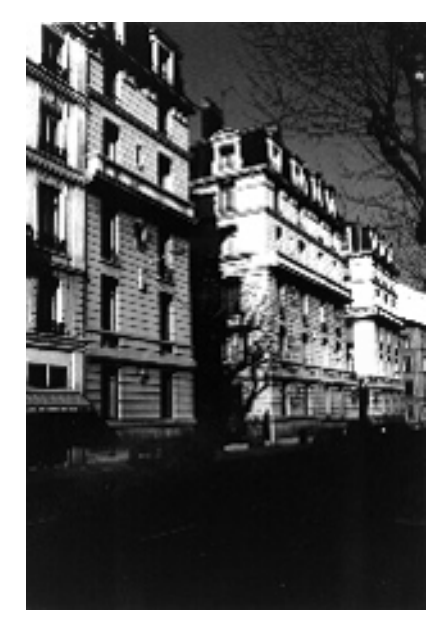
Figure 5. (above) Eugène Huguet. Maisons à loyer, 7–9, rue de Bonnel, Lyon, 1895–7; facades.