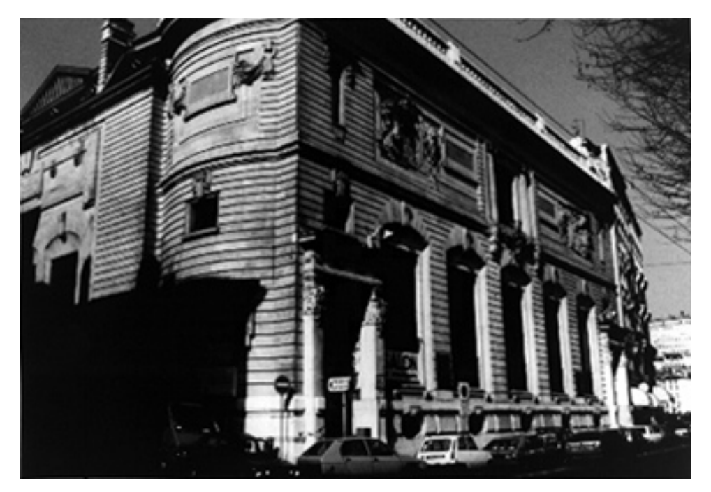
Figure 3. (above) Eugène Huguet. Palais Municipal des Expositions et Conservatoire, quai de Bondy, Lyon, 1902–4; facade.