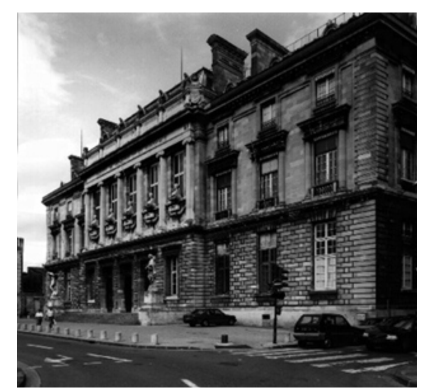
Figure 9. (below) Jean-Louis Pascal. Faculté de Médecine et de Pharmacie de Bordeaux, l'atrum.

Figure 8. Jean-Louis Pascal. Faculté de Médecine et de Pharmacie de Bordeaux, 1879–88; facade on the Place d'Aquitaine.