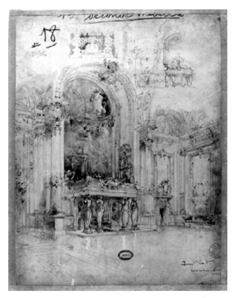
Figure 11. Paul Philippe Cret. "Une Tribune dans une salle de fêtes" (a mezzanine in a room for formal social gatherings). Esquisse de 1<sup>ere</sup> classe, 1<sup>ere</sup> seconde médaille, 11 October 1900. (Paris, École Nationale Supérieure des Beaux-Arts.)

with which the drawing was done – in twelve hours en loge (Fig. 11). The delicate cascade of ink lines, with splashy accents of blue and gold, appears vaguely baroque, vaguely rococo, even, because of the asymmetry of the acute perspective, vaguely art nouveau; in short, a witty confection of styles suggestive of elegant events.<sup>58</sup> He received a 1 <sub>ère</sub> seconde médaille in this concours in 1900.