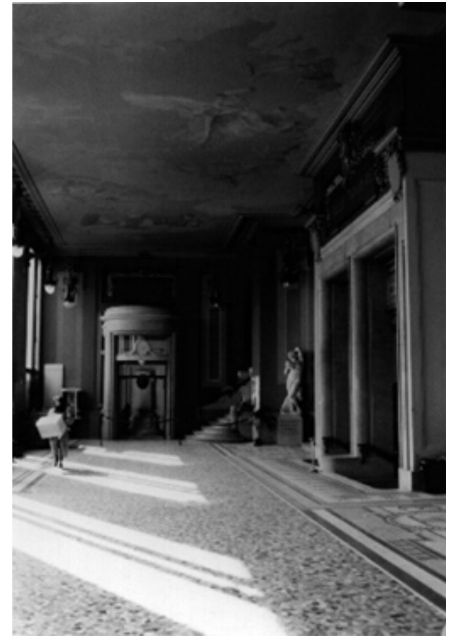
Figure 4. (right) Eugène Huguet. Palais Municipal des Expositions et Conservatoire; vestibule d'honneur .