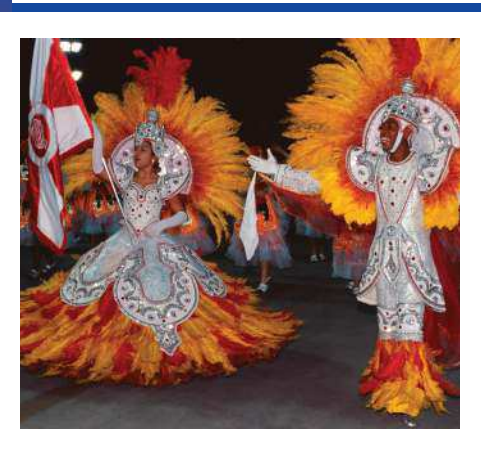
Carnival in Brazil