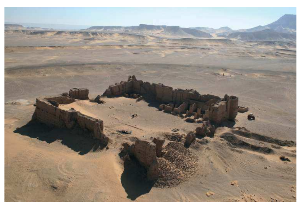
Figure 1.4 The El-Deir fortress (B.-N. Chagny).

The network, however, is much wider. El-Deir, at the starting point of one of the quickest roads to the valley, would have been a perfect checkpoint on the tracks leaving the oasis toward the east, and the last water point before the seven-day trip to the valley. Other connections with the valley opened up at Dush, in southern Kharga, or at Balat in Dakhla. But the oasis was also the gateway for further expeditions inside the desert lands. Since prehistoric times, people in Egypt walked through the Western Desert, as many inscriptions attest in the Eastern Sahara. In pharaonic and Roman times, great expeditions were undertaken in quest of mineral resources or commercial exchanges. In the network of the desert tracks, the western oases played a key role, as they were a link between Egypt and the deeper desert, as well as both south and west to other parts of Africa. The oases themselves produced a number of resources, both mineral and agricultural, needed by the society of the Nile Valley, either because they were lacking in the valley or because they could be produced far more efficiently in the oases. The desert routes were thus of substantial economic importance to Egypt, most of all in the Roman period. It is no surprise that the Romans built a chain of fortresses along the caravan routes crossing the Kharga Oasis.