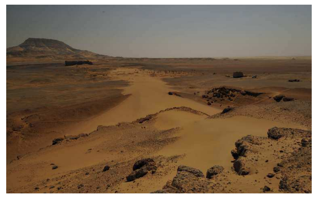
Fig. 1.3 The settlement at El-Deir (G. Bosio).