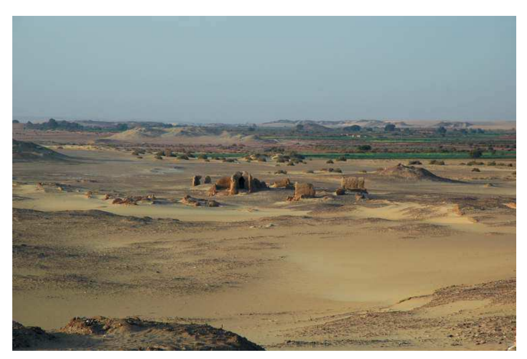
Fig. 1.2 The settlement at Amheida, view (Excavations at Amheida).